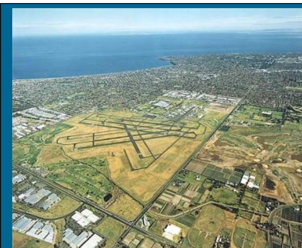
Aerial view of Moorabbin Airport

Moorabbin Airport also has several Citation jets which visit on a weekly basis. The largest visitors we see at Moorabbin on an infrequent basis are DC3s. We have had C130 RAAF Hercules land but most of the taxiways can't support their weights.