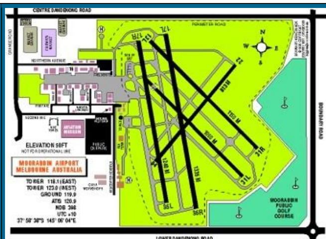
Diagram of runways and other Moorabbin Airport facilities